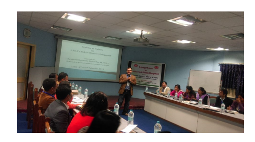
ASHA training on Disaster Management