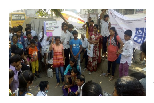
Moments from the street play

The services offered during this health checkup were Dental check up, Albendazole and Vitamin A supplementation. Along with general dental checkup, tooth pastes were distributed to promote oral hygiene among the school children.