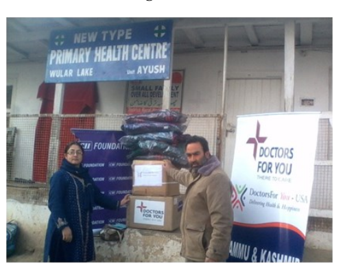
Distribution in Primary Health Center Wular Lake, Bandipora