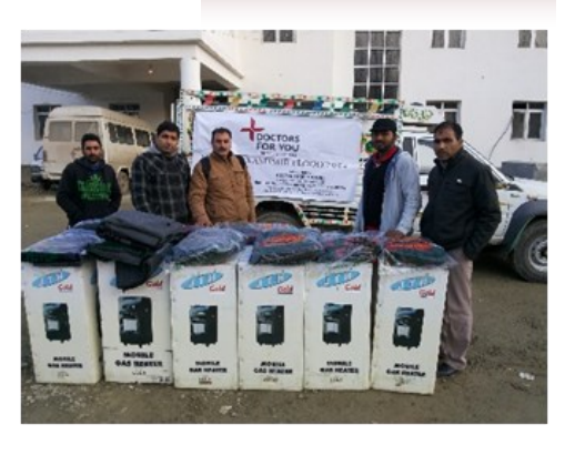
Donation of Medicines, heaters and Blankets in Sub District hospital Magam, Budgam

DFY is providing Gas heater, Blankets and bedding to all the selected facilities. The numbers are customized as per the facility's requirements.