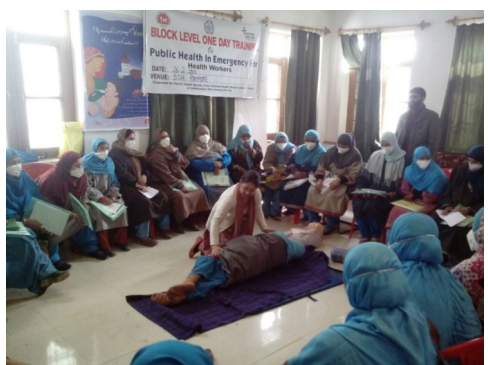
BLS session at Pampore Block, Pulwama District