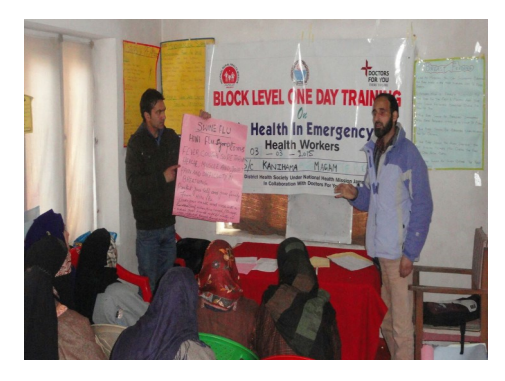
Session on Swine Flu in ASHA training on Disaster Management at Magam Block , Budgam District